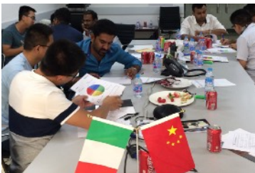
Asia-Pacific managers of an Italian firm discuss cultural profiles in Shanghai, China