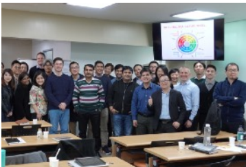
Intercultural leadership workshop for a French firm's global managers in Seoul, South Korea